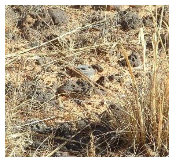
[Many mines are visible in the minefield.]