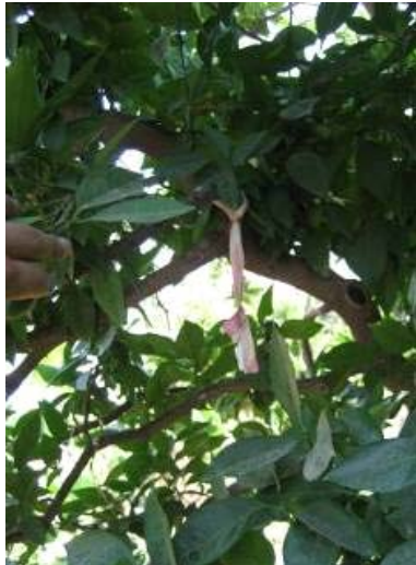
The foliage makes it credible that it could have been missed.