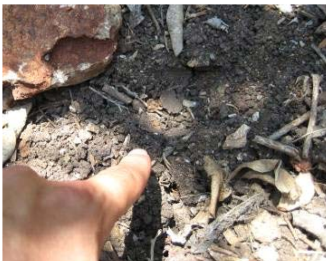
The picture above shows the site where the M77 was reported to have been found.

While it is unlikely that a submunition left hanging in a tee would rust on one side, a submunition pressed into the ground for a significant period would probably do so. Because the two munitions are similar and had been moved prior to the investigators seeing them, one