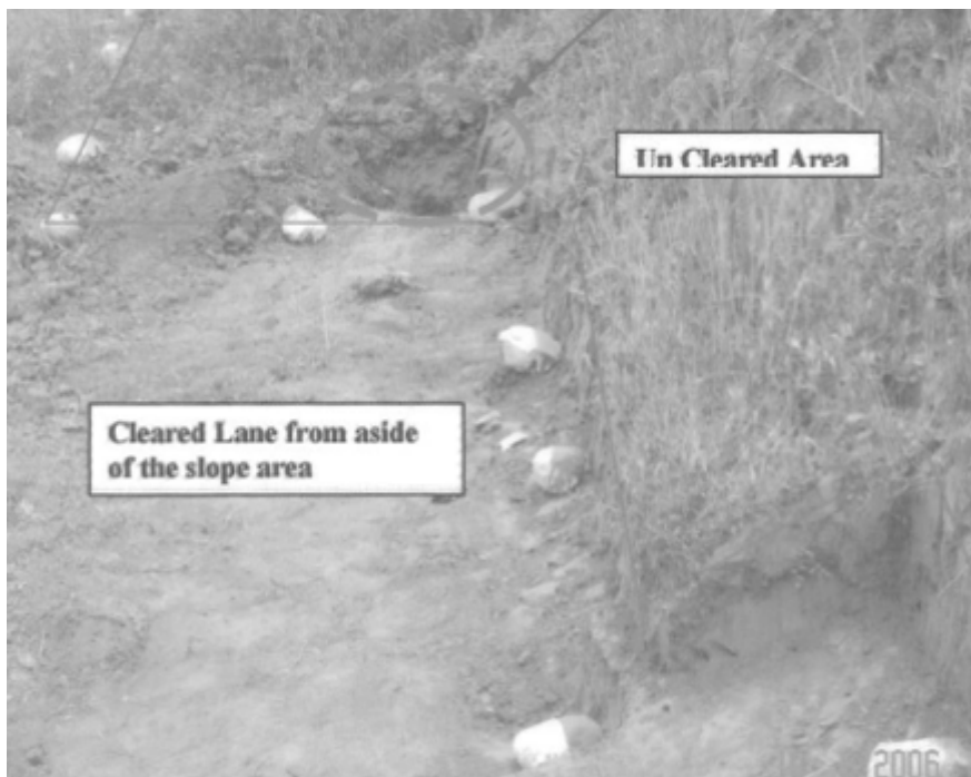
“Cleared Lane from aside of the slope area”

As it is explained that the deminer had worked from aside the slope area where the space was very tight and he couldn't use his hand freely the height and the hardness of the ground and the tightness of the space made him to use the trowel vertically